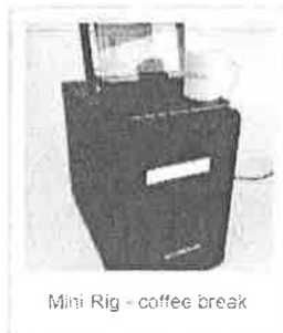
Mini Rig - coffee break